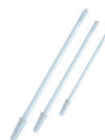
SU25 Karman Type Cannulae